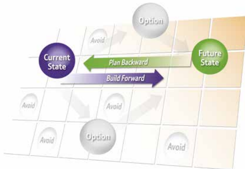
Fig. 1: IT optimised within the business by planning backward, and building forward.

When building the cloud implementation strategy, BT recommends that companies work according to the principle: plan backwards, build forward. When BT consultants work with customers to develop a cloud strategy they typically begin by defining the desired future state of the company, after which a roadmap is planned backward to where the company is today. In this way short-term requirements and long-term goals are properly aligned.